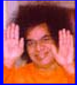
Love All. Serve All.

The newsletter can be read online at www.omsaimandir.org